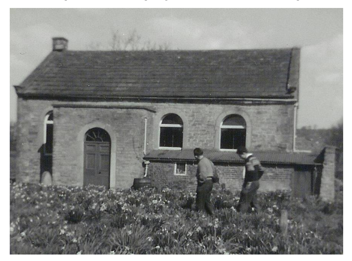
Fig.2 The meeting house before the 1980s refurbishment, showing the modern glazing, the lean-to cloakroom addition and the flat-roofed porch.